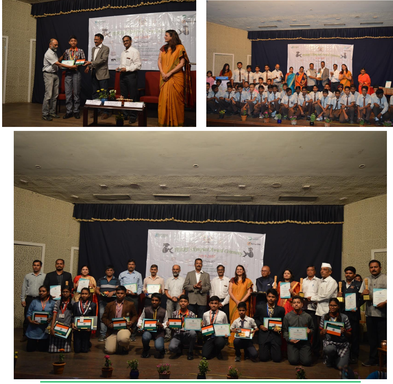
306 Multicon Square Next to Manohar Mangal Karyalay, Erandwane, Pune 411004