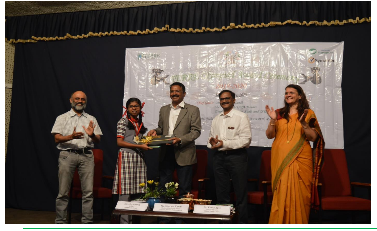
306 Multicon Square Next to Manohar Mangal Karyalay, Erandwane, Pune 411004