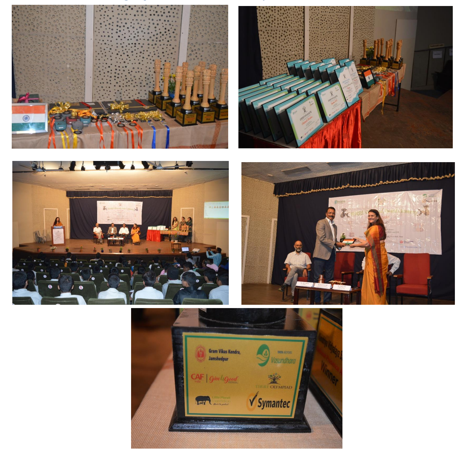
306 Multicon Square Next to Manohar Mangal Karyalay, Erandwane, Pune 411004

Below are some glimpses of the award ceremony: