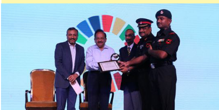
128 INF BN (Territorial Army) Eco Rajputana riffsles - Winner