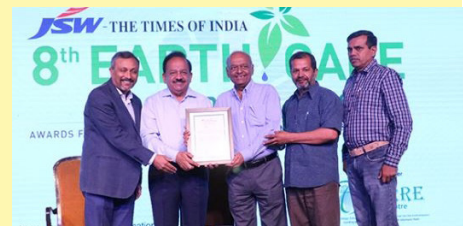
Vivekananda Research & Training Institute, Kutch, Gujarat - Commendation