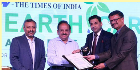
Solidaridad Network Asia Ltd, Bangladesh - Winner